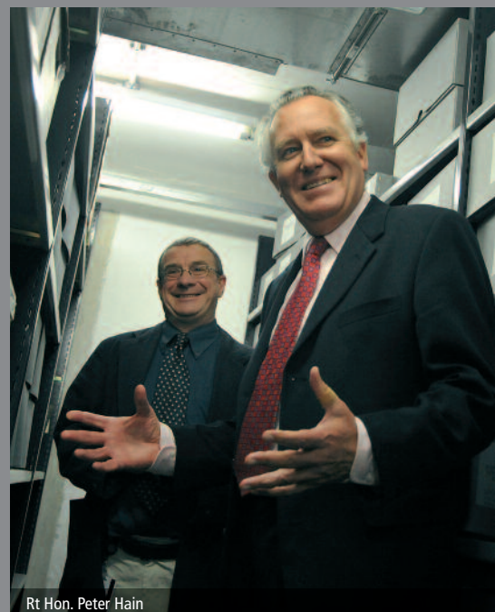
Rt Hon. Peter Hain