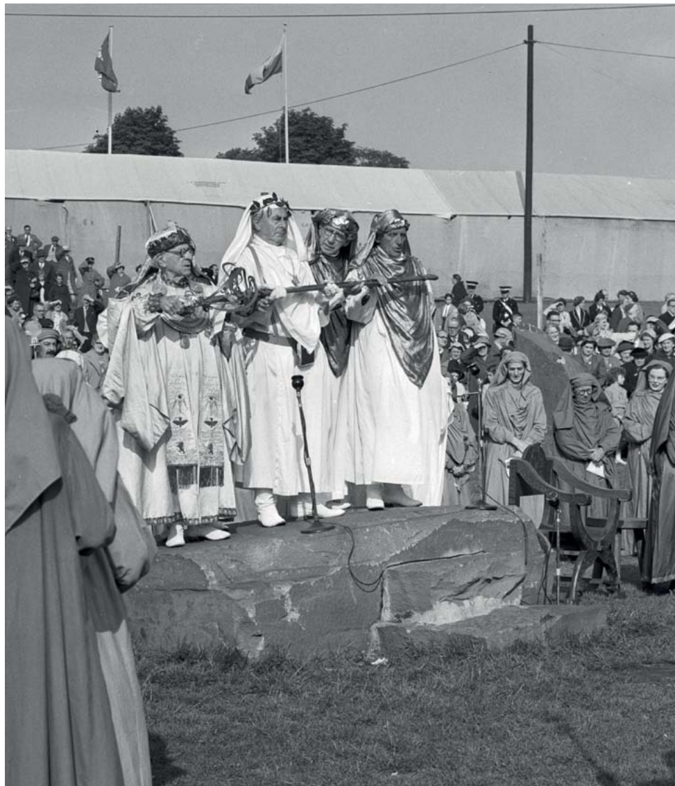
Yr Archdderwydd, 6 Awst 1956, The Archdruid, 6 August 1956 gan Geoff Charles (gch16323)